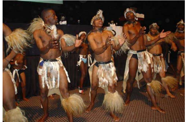
Zulu performers gave delegates a taste of their culture during the opening session of the Congress