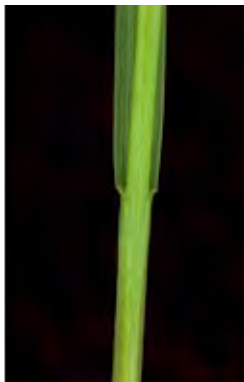
TOP Seeds MIDDLE Seedling BOTTOM Collar