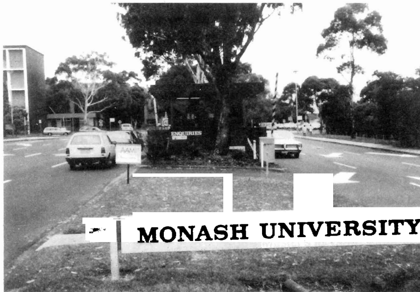
Monash University, Melbourne, Australia, site of the first International Weed Control Congress.